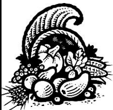
Thanksgiving Day Worship