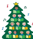
The Living Christmas Tree

+ Hackman's Bible Book Store, Whitehall, PA; followed by lunch @ a nearby diner.. Wednesday, December 12 th - 9:30 am in the lounge.